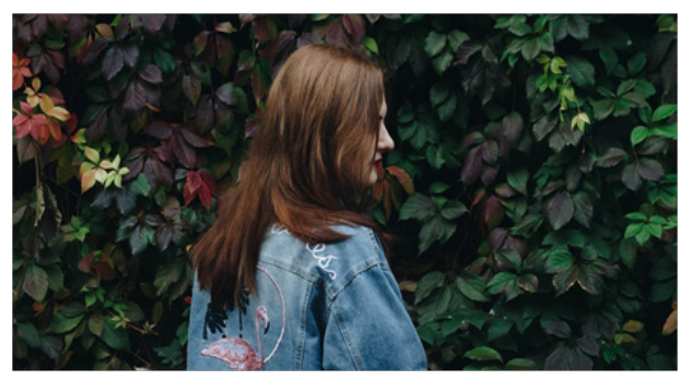
Figure 2 How Do Plant Stem Cells Help Hair Growth?<sup>1.7</sup> Plant stem cells possess similar genetic factors as human stem cells and can be used to influence the function of certain cells in our skin and hair follicles. Active plant stem cells work to increase the lifespan of hair follicles so that hair can remain in the anagen phase of the hair growth cycle for a longer period of time. Another hair-growth benefit of Asparagus Stem Cells is their ability to block the most common hair-killing hormone, DHT. High levels of DHT, as well as sensitivity to the hormone, are known for causing most male-pattern baldness and even female alopecia. Asparagus Stem Cells can aid the receptors in the skin to block the intrusion of DHT, and therefore minimizing the hair loss