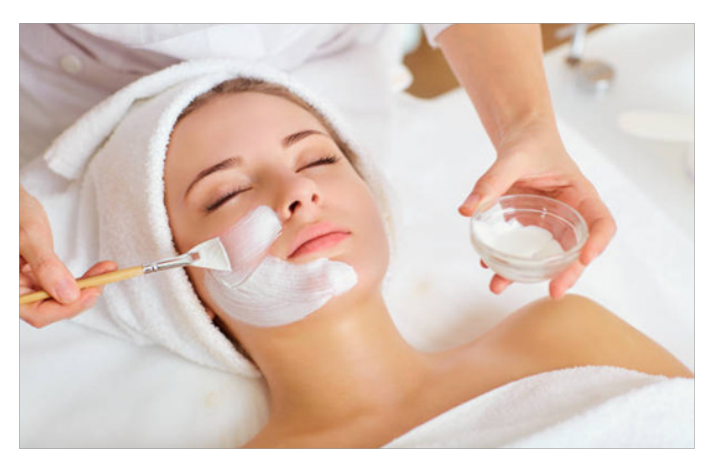
Figure 9 Facial Treatment.<sup>76-79</sup> Facial masks are the most prevalent cosmetic products utilized for skin rejuvenation. Facial masks are divided into four groups:

contrasted with different sorts of face masks, however they might be hard to discover and buy outside Asia (Figure 9).<sup>73–75</sup>