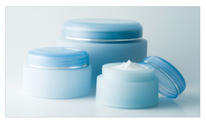
Figure 4 Skin Creams.<sup>26</sup> In general, creams for the skin should protect it from the sun and environmental pollutants, while also treating any specific problems. Look for the highest quality ingredients to ensure a cream's ability to live up to its claims. Enhance the circulation of blood flow by massaging creams into your skin several times a day.

Lips makeup : Lipstick, lip gloss, lip liner, lip plumper, lip balm, lip stain, lip conditioner, lip primer, lip boosters, and lip butters. Lipsticks are intended to add color and texture to the lips and often come in a wide range of colors, as well as finishes such as matte, satin, gloss and luster. Lip stains have a water or gel base and may contain alcohol to help the product stay on leaving a matte look. They temporarily saturate the lips with a dye. Usually designed to be waterproof, the product may come with an applicator brush, directly through the applicator, rollerball, or could be applied with a finger. Lip glosses are intended to add shine to the lips and may add a tint of color, as well as being scented or flavored for a pop of fun. Lip balms are most often used to moisturize, tint, and protect the lips. Some brands contain sunscreen. Using a priming lip product such as lip balm or chapstick can prevent chapped lips (Figure 5).<sup>27–30</sup>