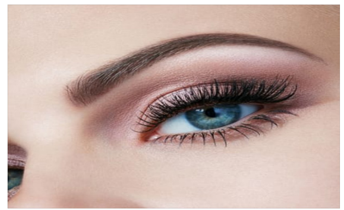
Figure 8 Eye Makeup.<sup>60–62</sup> Kohl was a broadly utilized conventional cosmetic. It might be an unavoidable wellspring of lead harming in those regions and among people from those regions who have moved to created countries. Regardless of the way that cosmetic items experience rigorous testing to guarantee they are alright for human use; a few clients report mellow discomfort following their application. The cutaneous changes, for example, unfavorably susceptible dermatitis, are very much reported, yet the visual changes related with eye cosmetic utilize are less so. Some pigmented cosmetic items may amass inside the lacrimal framework and conjunctivae over numerous long periods of utilization, yet quick reports of eye discomfort after application are generally normal. Changes to the tear film and its dependability may happen shortly after application, and contact focal point wearers can likewise be influenced by focal point spoliation from cosmetic items. Also, creams utilized in the avoidance of skin maturing are regularly connected around the eyes, and retinoids present in these formulations can affect meibomian organ work and might be a contributing factor to dry eye disease.

Bronzer gives skin a bit of color and contours the face for a sharper definition or creates a tan-look. Bronzer is considered to be more of a natural look and can be used for everyday wear. Bronzer enhances the color of the face. It comes in either matte, semi-matte/satin, or shimmer finishes (Figure 8).<sup>57–59</sup>