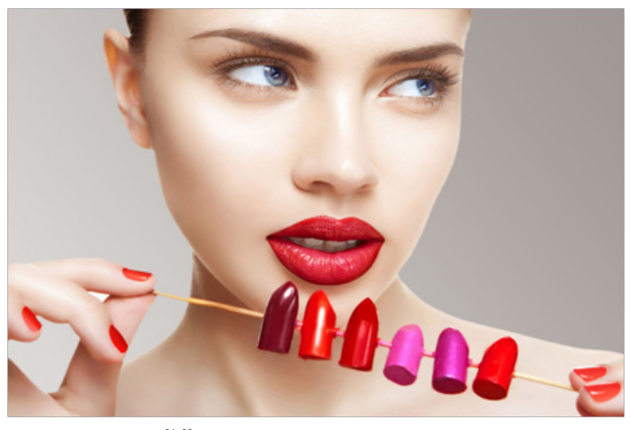
Figure 5 Lip Color.<sup>31–33</sup> Makeup artists and advertisements for cosmetics often claim that lip color can influence facial skin's apparent lightness. Currently, we do not have scientific evidence to either support or deny these claims. The luminance contrast between facial features and facial skin is greater in women than in men, and women's use of make-up enhances this contrast. In black-and-white photographs, increased luminance contrast enhances femininity and attractiveness in women's faces, but reduces masculinity and attractiveness in men's faces. In Caucasians, much of the contrast between the lips and facial skin is in redness. Red lips have been considered attractive in women in geographically and temporally diverse cultures, possibly because they mimic vasodilatation associated with eternal desire.

Lips makeup : Lipstick, lip gloss, lip liner, lip plumper, lip balm, lip stain, lip conditioner, lip primer, lip boosters, and lip butters. Lipsticks are intended to add color and texture to the lips and often come in a wide range of colors, as well as finishes such as matte, satin, gloss and luster. Lip stains have a water or gel base and may contain alcohol to help the product stay on leaving a matte look. They temporarily saturate the lips with a dye. Usually designed to be waterproof, the product may come with an applicator brush, directly through the applicator, rollerball, or could be applied with a finger. Lip glosses are intended to add shine to the lips and may add a tint of color, as well as being scented or flavored for a pop of fun. Lip balms are most often used to moisturize, tint, and protect the lips. Some brands contain sunscreen. Using a priming lip product such as lip balm or chapstick can prevent chapped lips (Figure 5).<sup>27–30</sup>