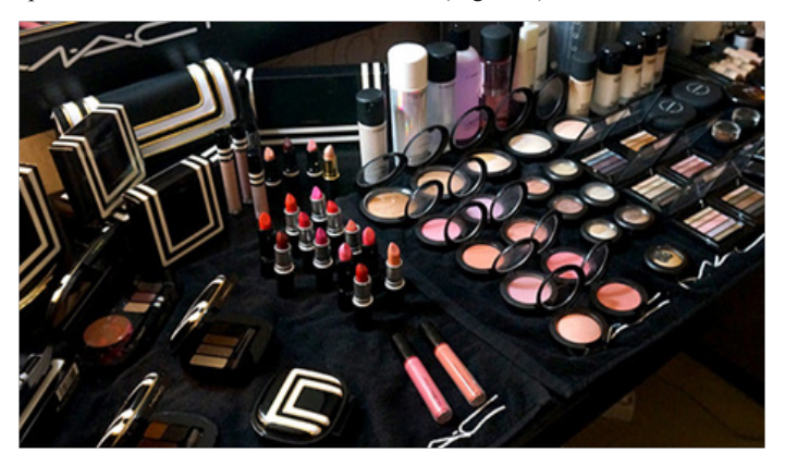
Figure 3 Modern Day Cosmetics.<sup>18,19</sup> Professional makeup artists have been perfecting techniques to get ordinary beauty products to multi-task for years. Cosmetics companies are now using advanced technology to develop multipurpose products that emulate these techniques. Foundations are no longer designed to simply smooth complexions. Many now boast different ingredients to target varying skin needs, such as salicylic acid for acne or jojoba oil for dry skin. Numerous brands have also created multipurpose stains with a creamy consistency and a neutral color that can be used on cheeks, lips and eyes. Some shades of these creamy all-over-color sticks also offer a little shimmer or gold sparkle, so that it can glide across eyebrow bones, shoulders or cleavage as a highlighter -- Lauren Balukonis, beauty division at 5W Public Relations.

enchanting. In Elizabethan England, colored red hair becomes stylish. Society women wear egg whites over their countenances to make the presence of a paler appearance. Women in Ancient Egypt utilized kohl, a substance containing powdered galena (lead sulfide-PbS) to darken their eyelids, and Cleopatra is said to have washed in milk to brighten and diminish her skin. By 3000 B.C men and women in China had started to recolor their fingernails with hues as indicated by their social class. The Chinese re-colored their fingernails with gum arabic, gelatin, beeswax, and egg. Chou administration royals don gold and silver, with ensuing royals sporting dark or red. Lower classes were prohibited to wear splendid hues on their nails. Greek women utilized harmful lead carbonate (PbCO<sub>2</sub>) to accomplish a pale composition. Muds were ground into glues for cosmetic use in conventional African social orders and indigenous Australians still utilize a wide scope of pounded rocks and minerals to make body paint for services and commencements (Figure 3).