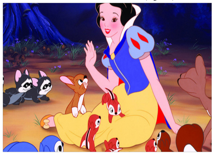
Figure 7 Disney princess, Snow White (Fairy Tale).<sup>54,55</sup> In the time that Snow White was released it was a common for the majority of women desired to have blush in their faces like her. Rouge originated as a thick paste, and was made from a range of things: from strawberries, to red fruits and vegetable juices, to the powder of finely crushed ochre. As nouns the difference between blush and rouge. is that blush being an act of blushing or blush can be the collective noun for a group of boys while rouge is red or pink makeup to add color to the cheeks; blusher. Blushers, those versatile successors to rouge, help light up a complexion and accent face structure and best features.

Rouge, blush, or blusher is cheek coloring to draw out the color in the cheeks and influence the cheekbones to seem more characterized. Blush is having a major moment, moving on from makeup pack staple to a featuring job in pretty much every celebrity central beauty look. Rouge comes in powder, cream, and fluid forms. Diverse blush colors are utilized to compliment distinctive skin tones. The antiquated Egyptians were the first to incorporate blush into their beauty customs. The middle Ages saw a drop in the utilization of blush, as red cheeks were related with whores. Amid the 1500s to the 1700s, blush was made with lethal synthetic substances. Beginning during the 1900s, as America wound up industrialized, blush started to be mass created and turned out to be a lot more secure to utilize (Figure 7).<sup>51–53</sup>