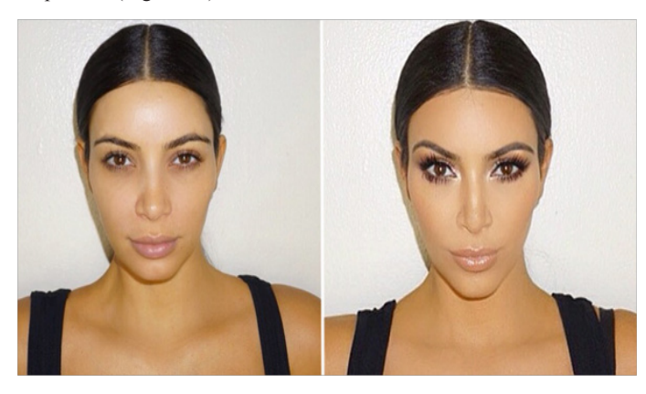
Figure 10 Contouring.<sup>82</sup> Contouring is the newest makeup craze that people just can't get enough of! This trend, made famous by none other than the Kardashian sisters, was created to make your face appear slimmer and more sculpted. The basic premise of it is to highlight the areas of face that someone would like to bring out, while shading in the parts she wants to make thinner.

of a more characterized facial structure which can be adjusted to inclination. More brilliant skin colored makeup items are utilized to 'feature' regions which are needed to attract thoughtfulness regarding or to be gotten in the light, while darker shades are utilized to make a shadow. These light and dark tones are mixed on the skin to make the deception of a more unequivocal face shape. It very well may be accomplished utilizing a "shape palette" - which can be either cream or powder (Figure 10).<sup>57,81</sup>