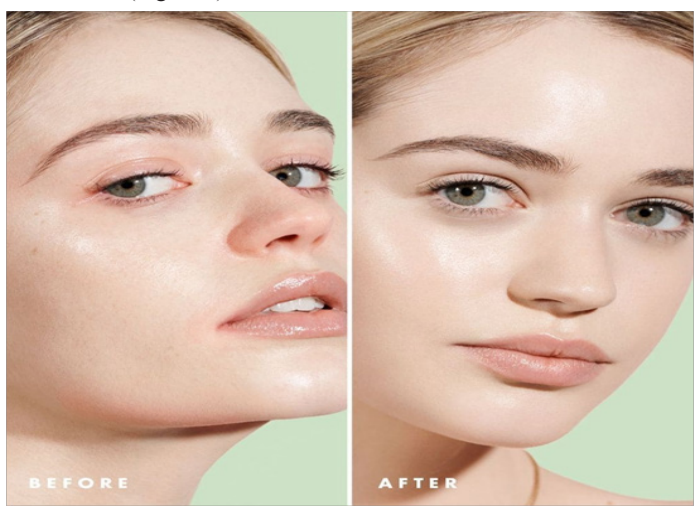
Figure 6 Comparison Between Before and After Use of Mineral Primer.<sup>36,38</sup> Photoaged skin is largely a result of chronic exposure to UV radiation. Photo aging, which causes premature aging in the appearance and function of the skin, is similar to chronological aging in that it is cumulative over time. Women frequently seek effective treatment for their irregular pigmentation as well as other clinical manifestations of photodamaged skin. The facial primer improved scores for the appearance of hyperpigmentation and other photoaging parameters immediately after the first application.

Primers: Primers are so beloved by experts because they can do so much more than just make foundation go on smoother. Primers are sort of like insurance for makeup. Despite the fact that they regularly wear numerous caps-smoothing, disguising, securing and preparingtheir primary jobs are to keep makeup on longer and give skin a smooth, faultless completion. This makes another layer between skin to anticipate skin break out and makeup stopping up pores. Preliminary makes an even tone all through the skin and makes makeup last more. Groundwork is connected all through the face including eyes, lips, and lashes. This item has a velvety surface and applies easily. Numerous makeup preliminaries are planned with silicone-based polymers, as dimethicone, in light of their ultra-smoothing impacts. Photoaged skin results from different environmental variables, in particular constant sun presentation. Dyschromia and scarcely discernible differences/ wrinkles are normal clinical appearances of photodamaged skin. The facial preliminary was appeared to be compelling and all around endured for quick and long haul improvement in the presence of mellow to direct hyper pigmentation and barely recognizable differences related with photo damage when utilized over a 12-week time frame (Figure 6).34-37